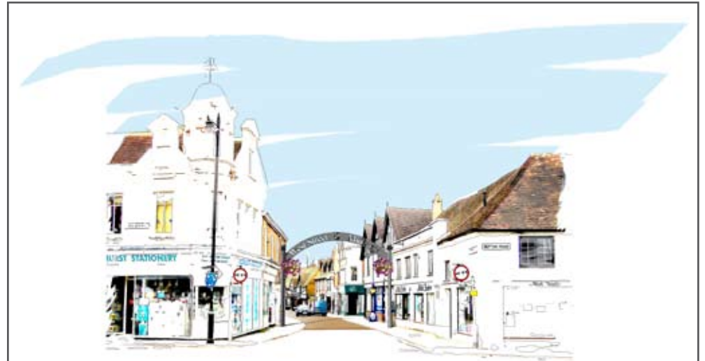
Visual depicting an example of a retail branding scheme - West Street, Midhurst

The steering group will be formed by July 2008 and the action plan will be published in the Autumn 2008. The group will be responsible for overseeing the selection, development and implementation of the proposals.