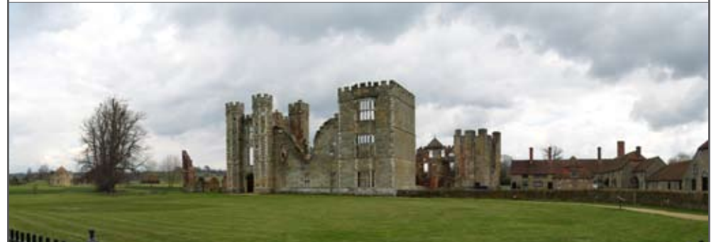
North Street - Midhurst, Cowdray Ruins - Midhurst