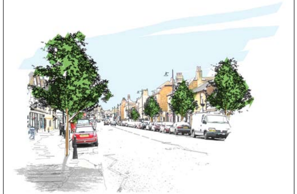
Visual depicting an example of a soft landscaping scheme - North Street, Midhurst